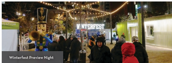
Winterfest Preview Night

This year’s Winterfest Preview Night will take place from 5–8 p.m. on Friday, Nov. 17.